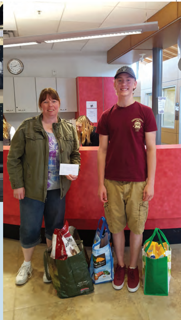
▲ ROBERTSON COLLEGE BUSINESS ADMINISTRATION STUDENTS