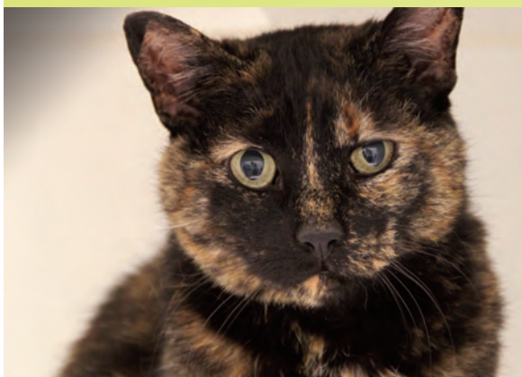
You supported Ginger during her 218 day stay at the WHS.

Patience will always persevere and such was the case for Ginger, a seven-year-old cat, who spent 218 days under the care of the WHS. Ginger had a particular personality and needed a family that would respect her. It was a challenge to find the right home for Ginger, but you made it happen by giving her the support she needed for nearly two-thirds of a year.