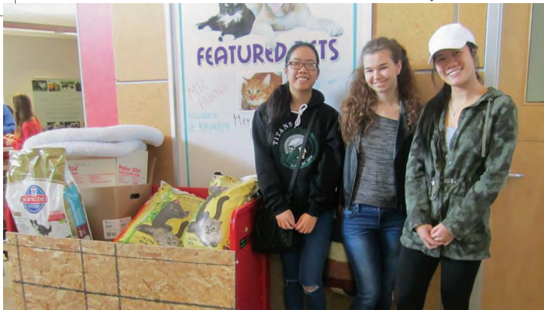
▲ TRANSCONA COLLEGIATE