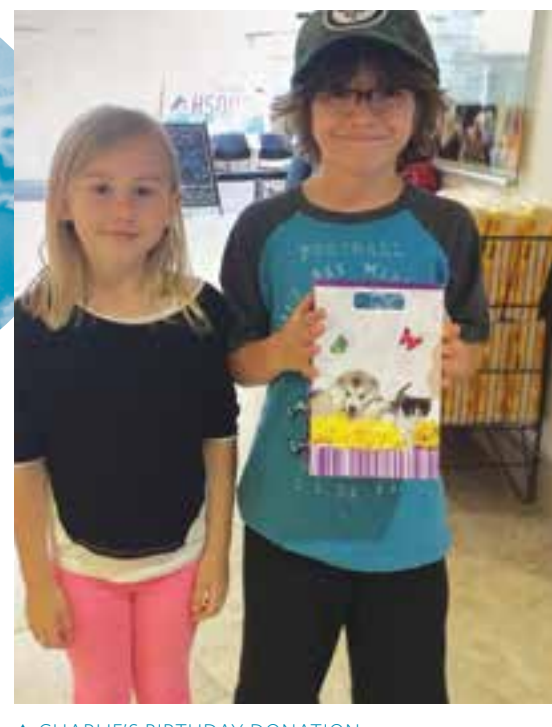
CHARLIE'S BIRTHDAY DONATION