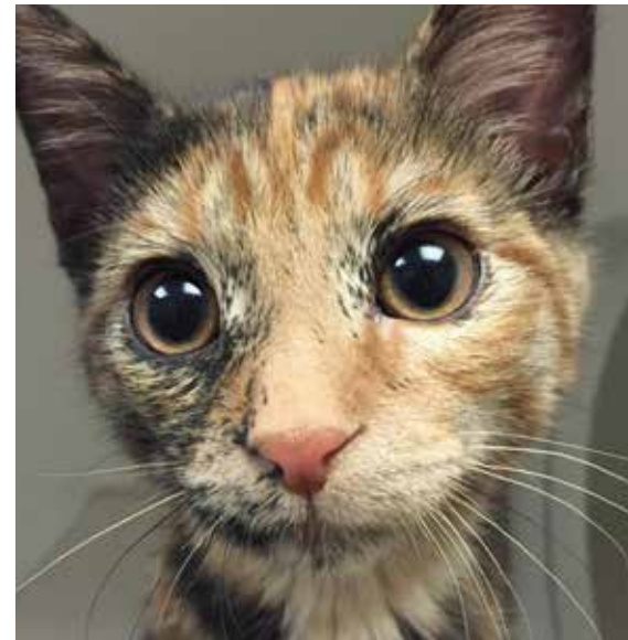
Cats like Tortellini are benefitting from the Care to Adopt program.

Instead of found cats being taken directly to the shelter, the WHS is asking finders to care for cats for a two week period. During that time the WHS will attempt to locate the cat's family and arrange to reunite them. If the cat is determined to be stray, the finder has the chance to adopt the cat for a fee that includes spay/neutering, vaccinations and identification – including a City of Winnipeg cat licence.