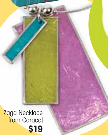
Zaga Necklace from Caracol $19