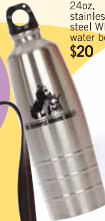
24oz. stainless steel WHS water bottle $20