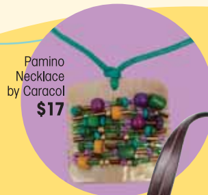
Pamino Necklace by Caracol $17

We've brought in more unique, one-of-a-kind items just for you. We now have more giftware, accessories and housewares than ever before!