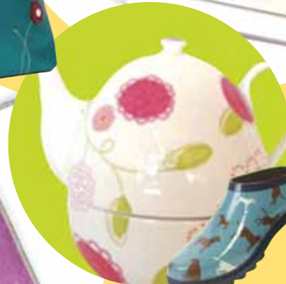
Cottage Rose Tea for One set $21.50