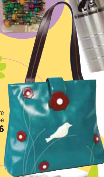
Chirp Tote from Espe $56