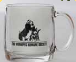
10oz. Glass WHS Mug $12