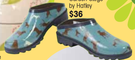
Garden Clogs by Hatley $36