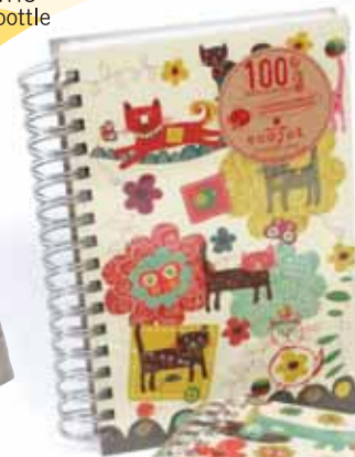
100% recycled lined notebook $16.50